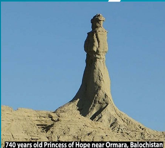
740 years old Princess of Hope near Ormara, Balochistan